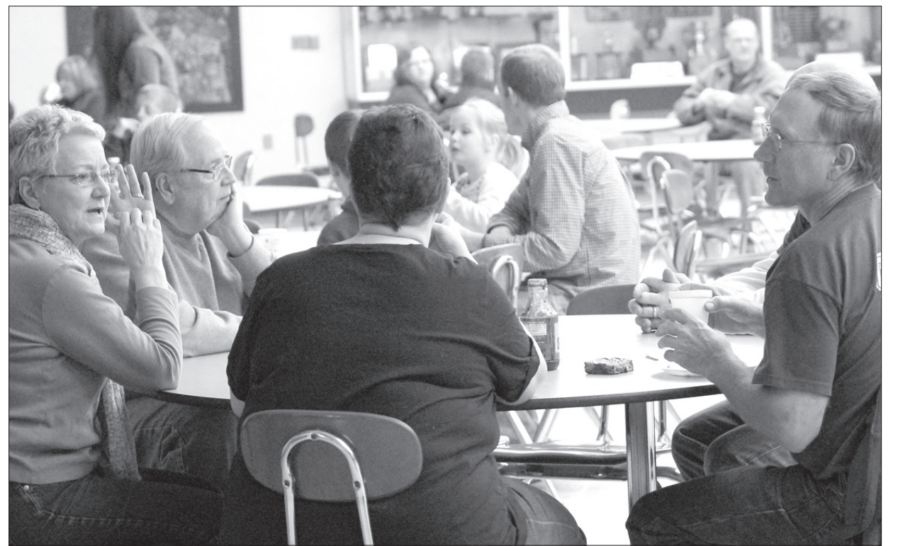
Community members take time to support the Grundy Center after prom pork supper fundraiser sponsored by the junior parents on Friday.

Alliant Energy offers the Iowa Agriculture Custom Rebate program for agri-businesses and farms to implement new or innovative ways to reduce energy demand. The company also offers a number of Prescriptive Rebate programs for farmers and agri-businesses looking to increase the energy efficiency of their facilities. These programs are available to Alliant Energy retail electric and gas customers located in its Iowa and Minnesota service area. For more information, visit alliantenergy.com/energyefficiency or call 1-866-ALLIANT (866-255-4268).